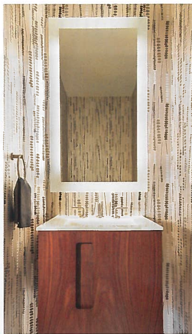
FAR LEFT: The gray tones of the master bedroom are complimented by saturated shades of pink inspired by a rag doll the homeowner received from her daughter. LEFT: In a tiny powder room near the entry, streamlined wallpaper, a sleek mirror, and a contemporary vanity keep the space from feeling cluttered.

in all directions, the views entertain and delight. Spot, the orange dog—a creation by the Finnish designer Eero Aarnio—overlooks the lofty scene.