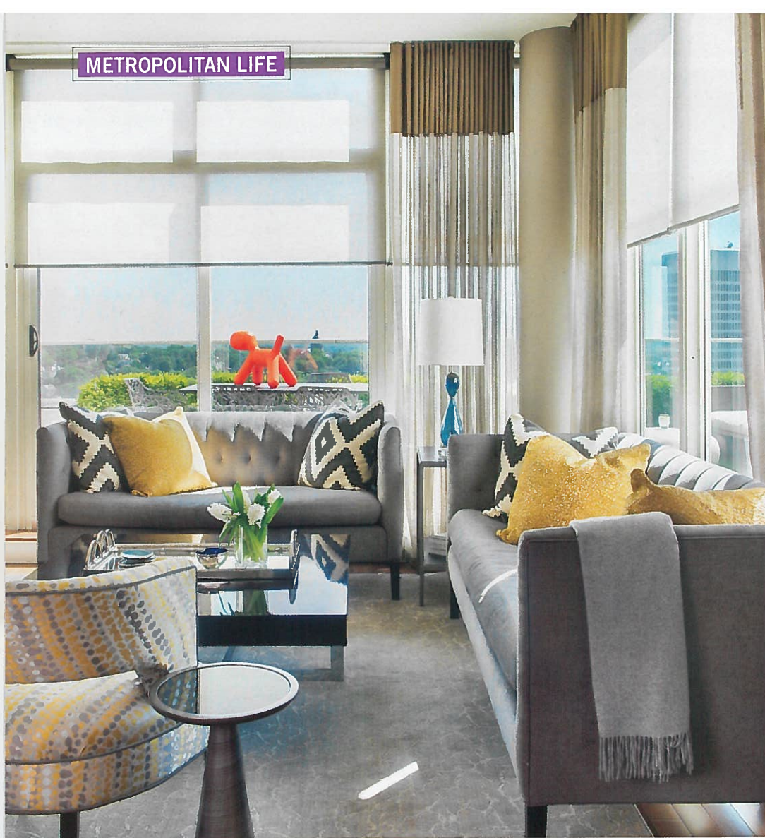
LEFT: The cool grays the homeowner loves form the backbone of the living room's decor, with blue and gold providing harmony and highlights. The sheer draperies at the floor-to-ceiling windows wear banding at the top, where the opaque fabric hides the window treatments' mechanics. BELOW: The entry foyer got a shot of drama with a recessed ceiling, the ideal home for a dramatic chandelier.