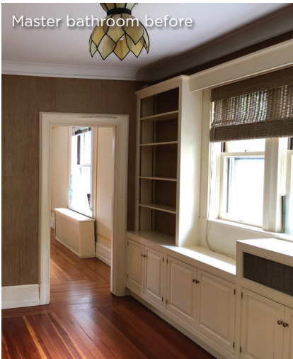
Master bathroom before